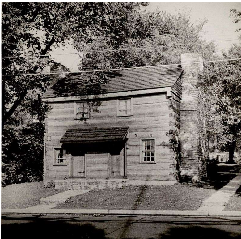
Galloway log house in 1938. The log house is now located by the Greene County Historical Society.